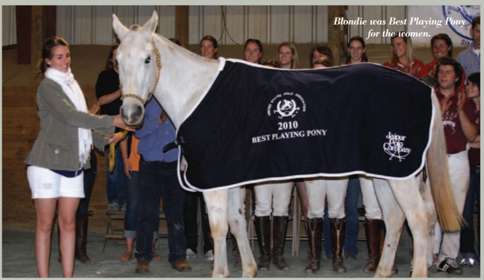
Blondie was Best Playing Pony for the women.