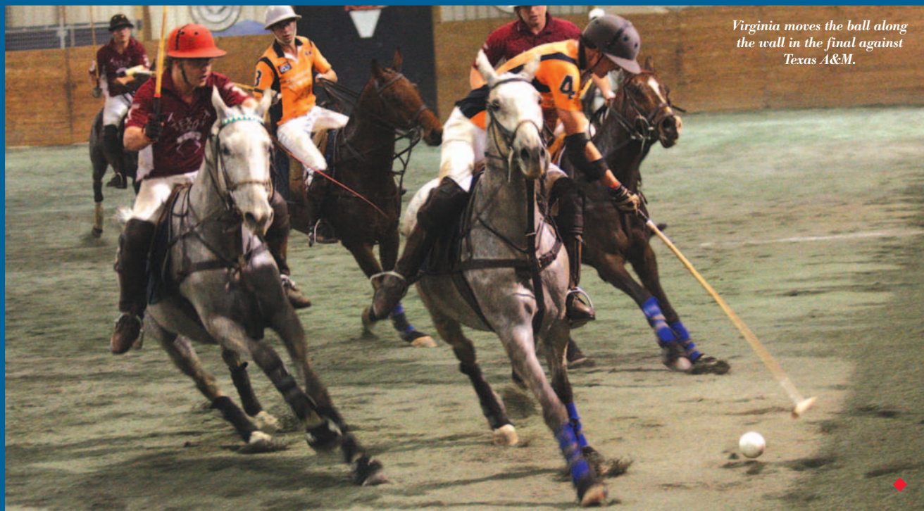
Virginia moves the ball along the wall in the final against Texas A&M.