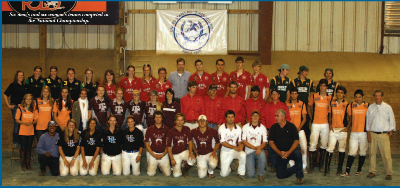
Six men's and six women's teams competed in the National Championship.